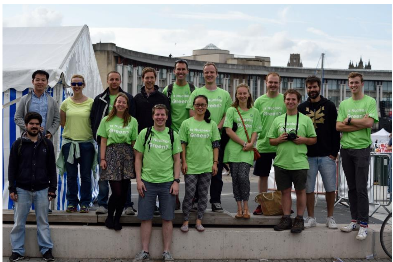
Figure 7. Team photograph at one of the public engagement events.