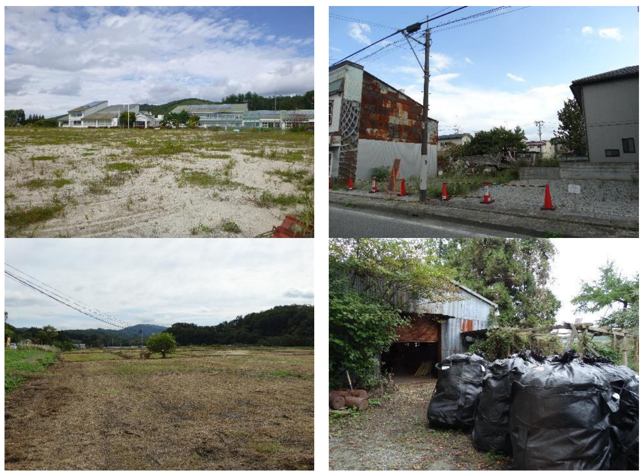
Figure 1. Clockwise from top left: Kawamata Junior High School with topsoil removed from its playing field; Collapsed house damaged by the earthquake; Deserted cattle farm with topsoil collected into sacks; Paddy fields with topsoil removed. All locations are within the evacuation area and so are uninhabited.

WM2017 Conference, March 5 – 9, 2017, Phoenix, Arizona, USA and infirm people. Figure 1 shows images taken from within the exclusion zone.