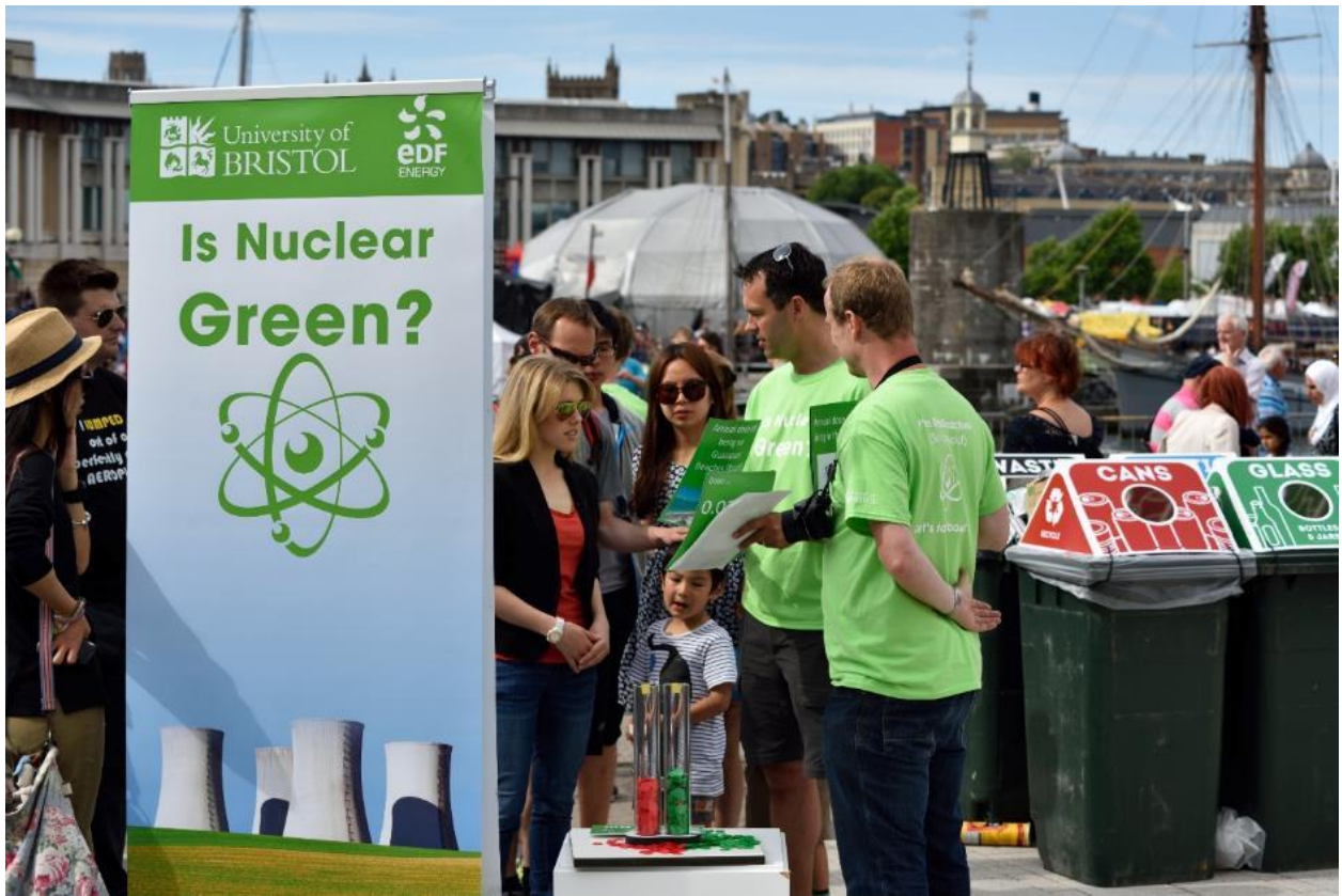
Figure 5. Dose rate flashcards explaining that radiation is a natural phenomenon.

The Twitter feed gained increasing popularity during the event, and in fact continues to make 'impressions'. Between our weekend event in July 2015 and mid-August 2015 the twitter feed achieved 10,000 views, showing that the online engagement was also successful. The 2016 event also made use of Twitter to enhance overall engagement.