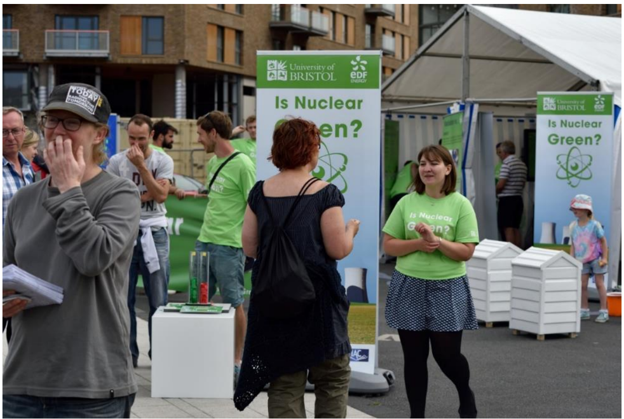
Figure 6. (background) The coin-drop voting system measuring impact; (foreground) Discussion with an anti-nuclear campaigner.