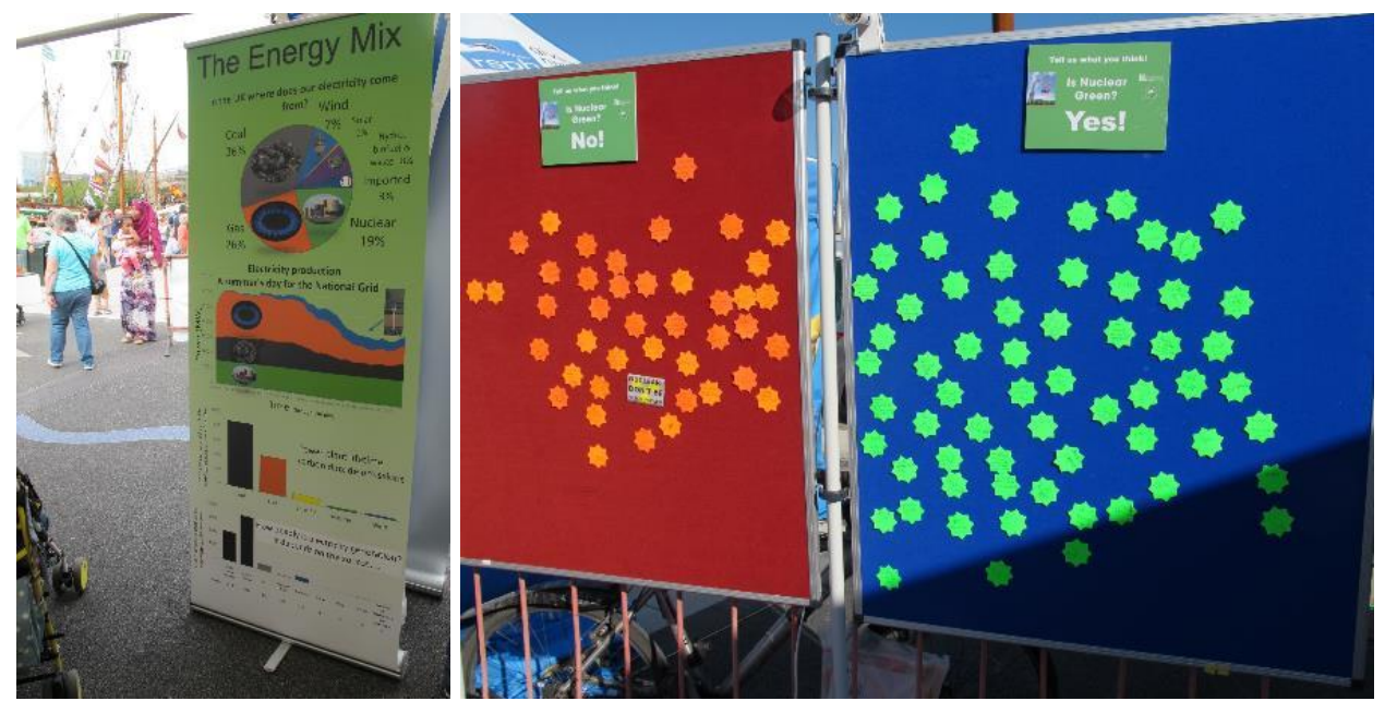
Figure 3. (left) Example of display posters using the current energy mix to make the case for nuclear power; (right) Opinions board allowing the public to express their views.

The exhibition also enabled the authors to receive feedback from the population of Bristol and surrounding areas to our 'Is Nuclear Green?' question. The authors discovered that approximately two-thirds of votes answered 'Yes', with many stating that nuclear is our best hope until an alternative is found, such as fusion or better storage of renewable electricity. Using polling by YouGov, similar feedback was obtained by the Nuclear Industry Association [4].